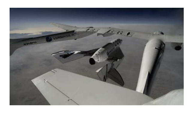
Figure 1: SpaceShipTwo release from WhiteKnightTwo

After release from WK2 at an altitude of about 46,400 feet, SS2 entered the boost phase of flight. During this phase, SS2's rocket motor would propel the vehicle from a gliding flight attitude to an almost-vertical attitude, and the vehicle would accelerate from subsonic speeds, through the transonic region (0.9 to 1.1 Mach), to supersonic speeds. The flight test data card