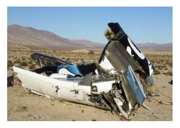
Figure 5: SpaceShipTwo Wreckage