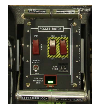
Figure 4: Feather Lock Handle - Unlocked Position

used during the accident flight indicated that the copilot was to unlock the feather during the boost phase when SS2 reached a speed of 1.4 Mach. However, a forward-facing cockpit camera and flight data showed that the copilot unlocked the feather just after SS2 passed through a speed of 0.8 Mach. Afterward, the aerodynamic and inertial loads imposed on the feather flap assembly were sufficient to overcome the system; as a result, the feather extended uncommanded, causing the catastrophic structural failure.